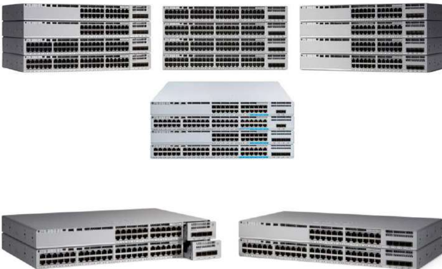
Figure 1. Cisco Catalyst 9200 Series switches

The Cisco Catalyst 9200 Series is made up of modular (C9200) and fixed (C9200L) switch models.