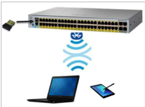
Figure 2. Over-the-air switch access using Bluetooth