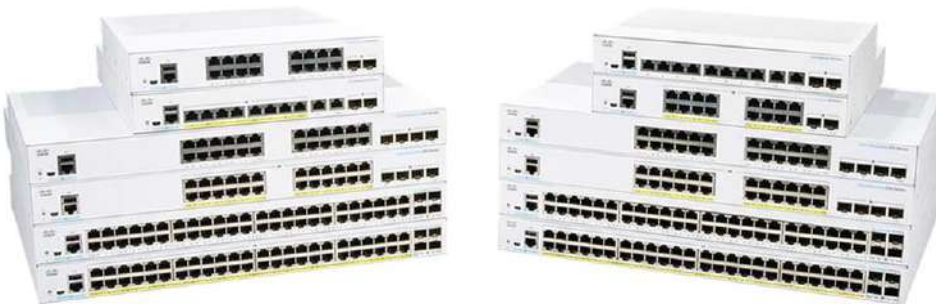
Figure 2. Cisco Business 350 series managed switches

The Cisco Business 350 Series Switches, part of the Cisco Business line of network solutions, is a portfolio of affordable managed switches that provides a critical building block for any small office network. Intuitive dashboard simplifies network setup, and advanced features accelerate digital transformation, while pervasive security protects business critical transactions. The Cisco Business 350 Series Switches provide the ideal combination of affordability and capabilities for small office and helps you create a more efficient, better-connected workforce. When your business needs advanced networking features and security for the digital transformation yet value is still a top consideration, you're ready for the Cisco Business 350 Series Switches.