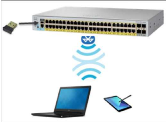
Figure 2. Over-the-air switch access using Bluetooth