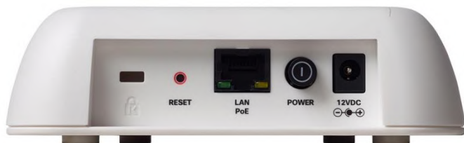
Figure 3. Back Panel of a WAP150 Wireless-AC/N dual radio access point with PoE