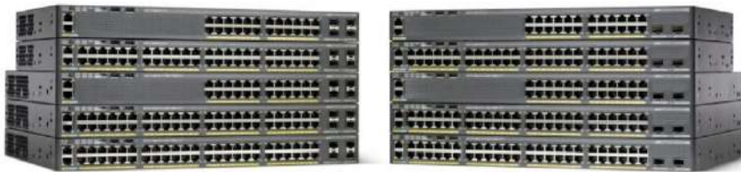
Figure 1. Cisco Catalyst 2960-X Series Switches

Cisco® Catalyst® 2960-X and 2960-XR Series Switches are fixed-configuration, stackable Gigabit Ethernet switches that provide enterprise-class access for campus and branch applications (Figure 1). They operate on Cisco IOS® Software and support simple device management as well as network management. The Cisco Catalyst 2960-X and 2960-XR Series provide easy device onboarding, configuration, monitoring, and troubleshooting. These fully managed switches can provide advanced Layer 2 and Layer 3 features as well as optional Power over Ethernet Plus (PoE+) power. Designed for operational simplicity to lower total cost of ownership, they enable scalable, secure, and energy-efficient business operations with intelligent services. The switches deliver enhanced application visibility, network reliability, and network resiliency.