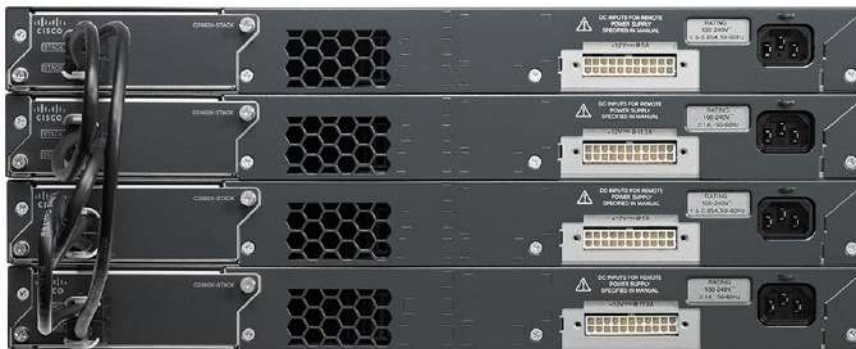
Figure 5. Cisco FlexStack-Plus switch stack

Cisco FlexStack-Extended enables a long-distance out-of-the wiring-closet stack option (floor to floor). It allows back-panel stacking of up to eight Cisco Catalyst 2960-X or 2960-XR Series Switches. FlexStack-Extended can be added to a Cisco Catalyst 2960-X or 2960-XR Series Switch with a back-panel stacking slot. Table 8 lists the switch combinations supported with FlexStack-Extended, and Table 9 lists the scalability and performance with the various software images. FlexStack-Extended is supported in Cisco IOS 15.2(6)E or later and is available in two module configurations: a fiber module and a hybrid module.