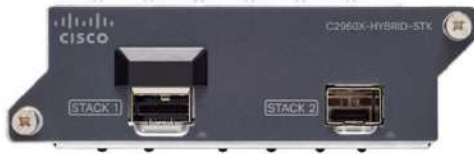
Figure 7. Cisco FlexStack-Extended: Fiber module