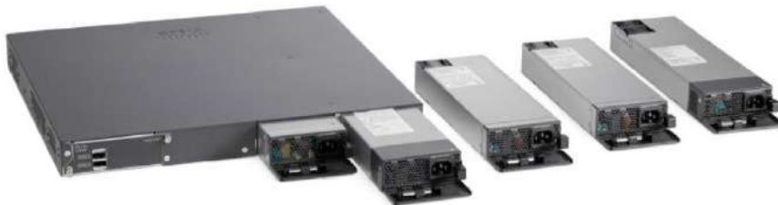
Figure 2. Cisco Catalyst 2960-XR Series power supply

Table 1 shows the different power supplies available in the 2960-XR Series switches and the available PoE power. Table 2 lists the PoE and PoE+ power capacity for the Cisco Catalyst 2960-X and 2960-XR Series. Table 3 gives the available PoE and switch power for the 2960-XR Series with different power supply combinations.