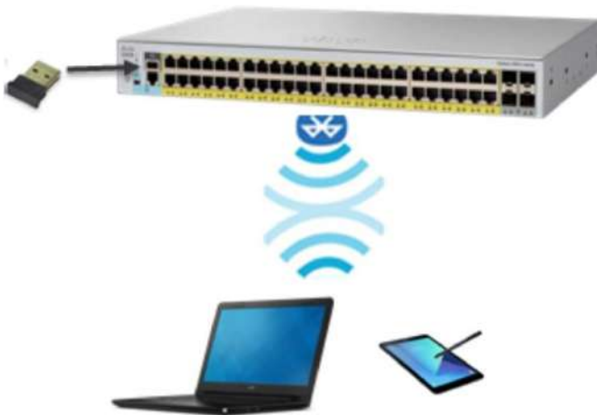
Figure 4. Over-the-air switch access using Bluetooth