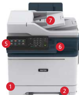
Xerox C315 Color Multifunction Printer