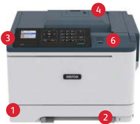
Xerox C310 Color Printer