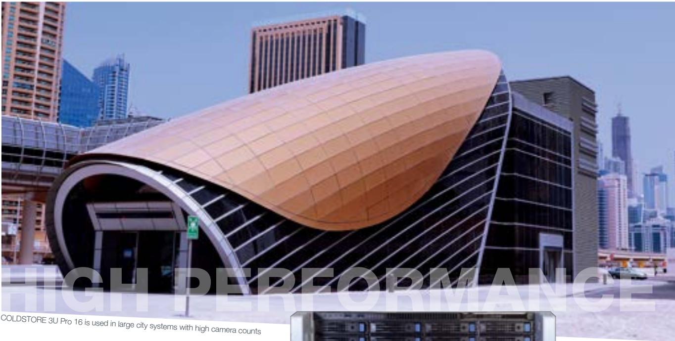
COLDSTORE 3U Pro 16 is used in large city systems with high camera counts

The world's most reliable surveillance storage system with increased throughput and performance