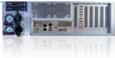
Rear view (above) showing the dual gigabit Ethernet ports, dual hot-swap power supplies and mirrored hot-swap solid state OS disks.

COLDSTORE disk capacity is subject to change. Please check our website for the most up to date disk capacities. www.veracityglobal.com