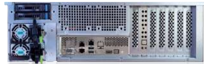
Rear view (above) showing the dual gigabit Ethernet ports, dual hot-swap power supplies and mirrored hot-swap solid-state OS disks.