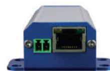
HIGHWIRE Longstar Ethernet and DC input