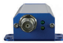
HIGHWIRE Longstar Coax and status LEDs