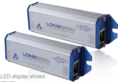
Smart LED display shows SAFEVIEW™ technology.

LONGSPAN delivers unrestricted 100Base-TX with 802.3af and 802.3at POE at distances far beyond the normal Ethernet limits for problem-free IP camera installation.