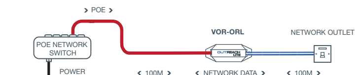
Diagram 2. If there is no POE available, upgrade the link with Veracity's low cost POE injector OUTSOURCE.

Diagram 1. OUTREACH Lite is powered by POE, so it can double Ethernet range without requiring a local power outlet.