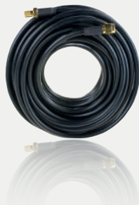
TIMENET Pro Antenna Extension Cable 10 metres

© Veracity UK Ltd 2024 All rights reserved. DV1.9EN Under no circumstances should this document be reproduced, distributed or changed, partially or wholly, without written, formal authorisation from Veracity UK Ltd. TIMENET PRO is a trademark of Veracity UK Ltd.