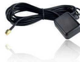
TIMENET Pro comes with antenna and 5 metre cable included.