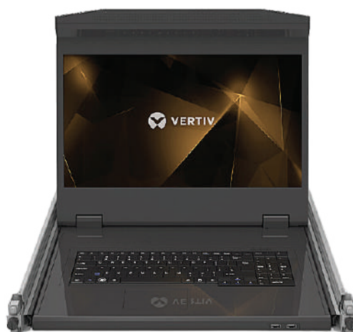
Vertiv 18.5" CLRA Local Rack Access Console

You understand how valuable data center real estate can be. A crowded server rack can make your job a lot harder. The CLRA Console is available with pre-integrated 8- and 16- port KVM that seamlessly fits into the same 1U the LCD tray is occupying, providing vastly improved utility while conserving space.